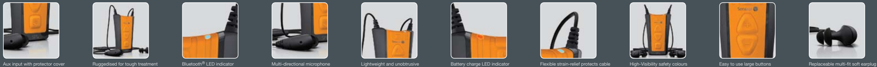
Aux input with protector cover Ruggedised for tough treatment Bluetooth® LED indicator Multi-directional microphone for clear communication Lightweight and unobtrusive Battery charge LED indicator Flexible strain-relief protects cable High-Visibility safety colours Easy to use large buttons Replaceable multi-fit soft earplug